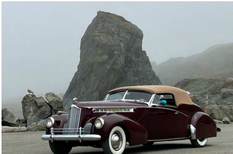
1940 Packard 180 custom bodied by Bohman & Schwartz at Goat Rock Beach.